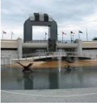
National D-Day Memorial, Bedford