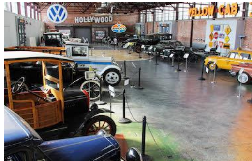
Virginia Museum of Transportation, Roanoke, not only steam locomotives, but automotive displays, too.

4pm-7pm Get-to-Know-Each-Other Reception, Vista Room at Holiday Inn. Dinner on your own with many restaurants nearby.