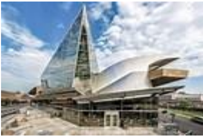
Taubman Museum, Roanoke